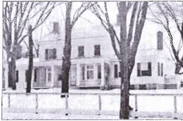
The Conkling House—the first Glens Falls Home

W E ARE CELEBRATING THE 100TH ANNIVERSARY, AND A CENTURY OF SERVICE, OF THE GLENS FALLS HOME. What began as a local expression of the late 19th century's progressive movement for elder care became a proven concept and a community institution during the 20th century. Now on the eve of the millennium, The Glens Falls Home is expanding to be ready for the incoming 21st century and beyond.